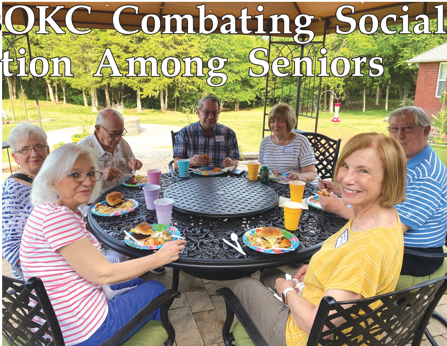
VillagesOKC members enjoy socializing over burgers during a recent cookout.

The U.S. Surgeon General recently issued an advisory calling attention to the public health crisis of loneliness, isolation and lack of connection in our country. Dr. Vivek Murthy officially gave the label of “epidemic” to loneliness.